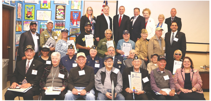
2018 Veteran participants and elected officials who presented proclamations to each veteran.