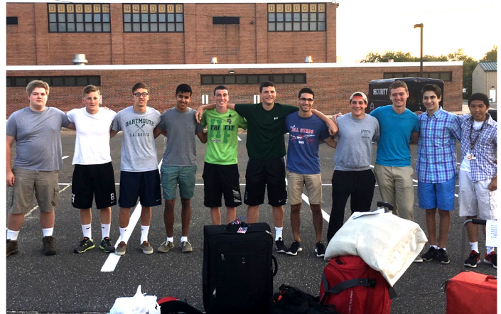
Hurry Up And Wait Students from Harborfields, Walt Whitman and Half Hollow Hills West waiting for their bus ride to Boys State in June 2016, just a few years ago.

Virtually each year since we began in 2009 with 2 students, we have been fortunate enough to be able to send more and more high school juniors, with this year's total coming in at 21. This is due to more people becoming aware of the program and its inherent benefits, and willing to donate to these students' education. This, in turn, becomes a benefit to all of us for the future of our country and its form of government.